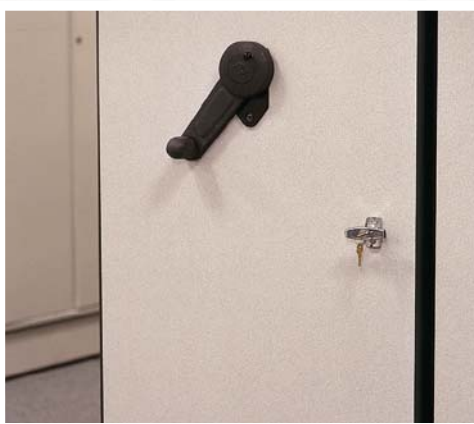
Right: Carriage locks keep records secure in open storage areas.

The Pennsylvania Department of Transportation (Penn DOT), along with several other state agencies, moved into the new Keystone Building and applied space efficiencies that they had experienced in their previous occupancy. They incorporated 12 Spacesaver mobile systems throughout five floors and saved filing space throughout their offices.