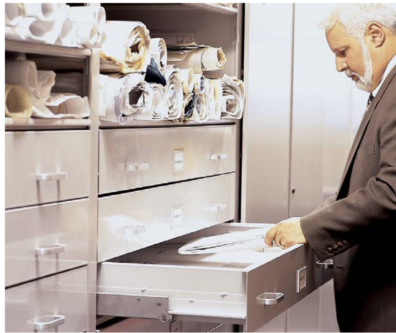
A mobile system with several storage options accommodates needs in the Sales Store.

Confidential records, which are located in several areas of the building, are stored in mobile systems on standard shelving with lockable carriages that restrict access or secured behind locked Spacesaver doors on a mobile system.