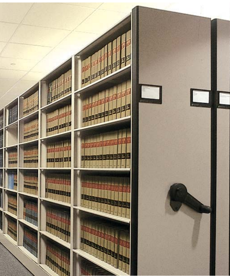
Above: Law Library system