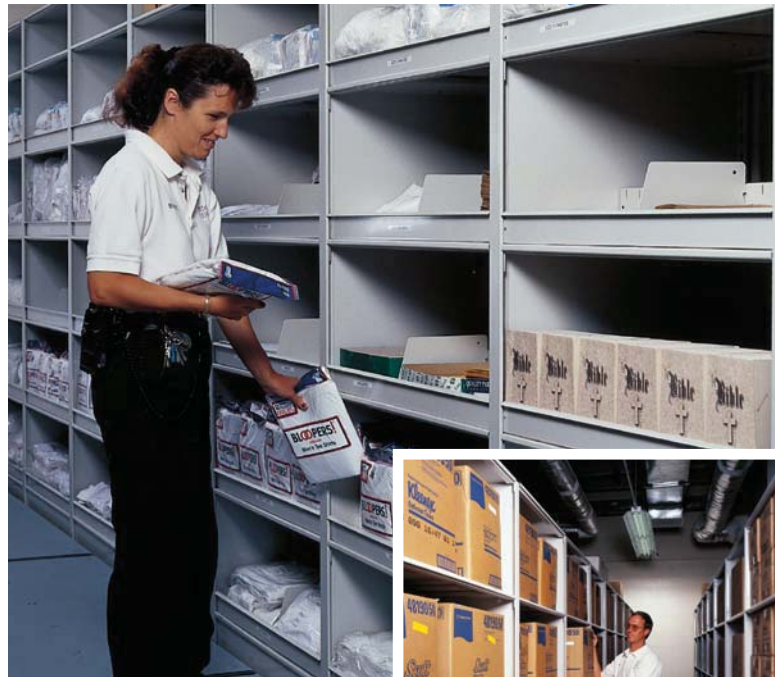
In general supply, the mobile system is designed to hold everything from small items to bulky boxes.

Sports equipment, game boards, books, paper products, toiletries and cleaning supplies are some of the items efficiently stored on a mechanical assist mobile system. The Spacesaver system makes fulfilling inmate requests easy because everything is labeled and well-organized. The shelving adjustability helps general supply personnel to fit all sizes of items on the shelves from small toiletries to very large bulk paper supplies. Shelf heights adjust as well as the shelf dividers to compartmentalize the storage and maximize the efficiency of the square footage.