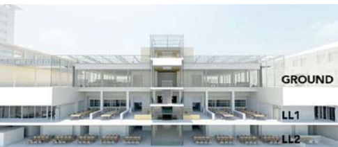
GROUND LL1 LL2