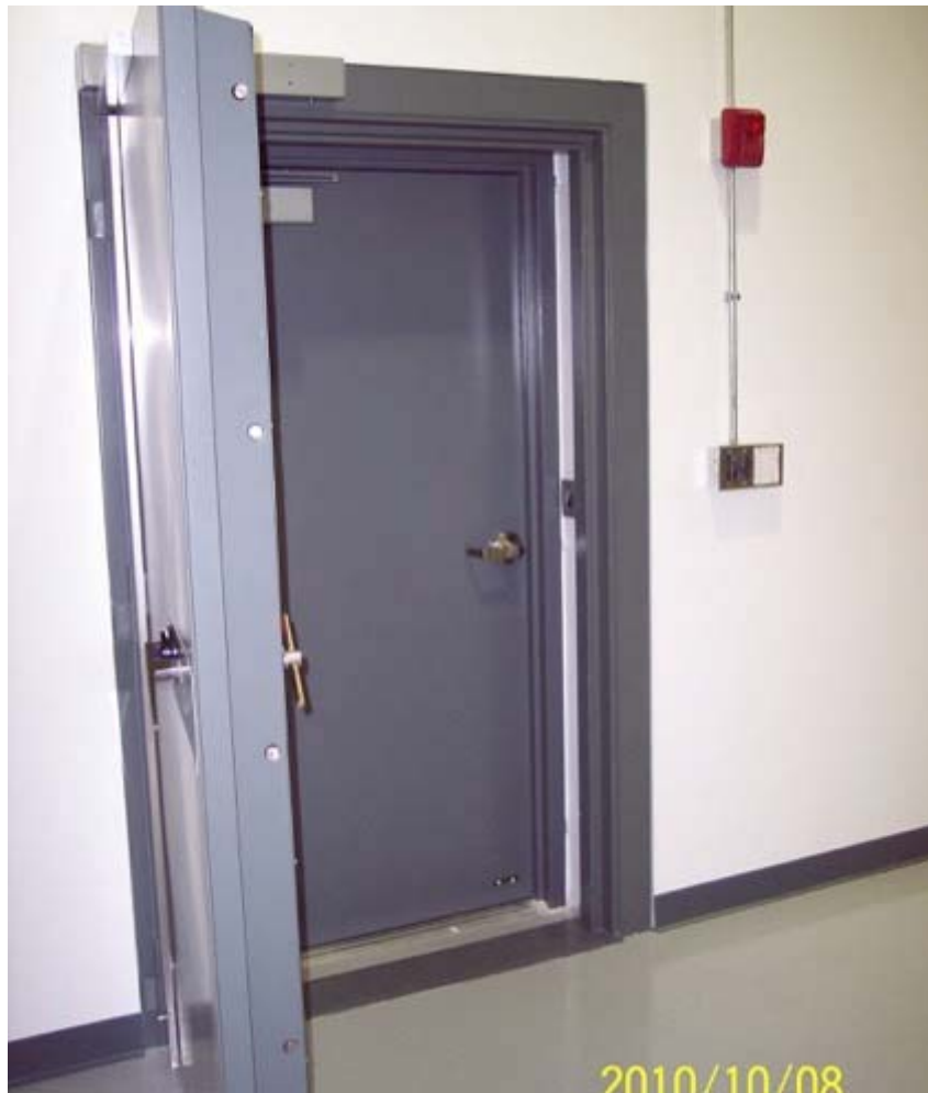
Outer Vault Door & Inner Door with Biometric Detection for Access Control