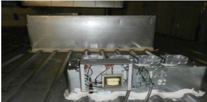
Cable Tray on vault Roof & Inner Electrical Boxes for Vault Service