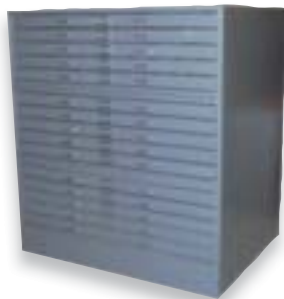
STANDARD & SPECIALTY DRAWERS