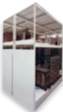
WIDE SPAN SHELVING