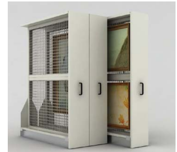
Optional end panels create a sleek finish.