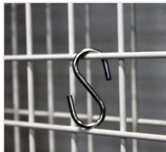
Stainless steel “S” hooks provide secure hanging of art.