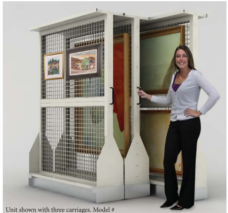
Unit shown with three carriages. Model #

End-panels - create a tidy, streamered lined look with steel end panels.