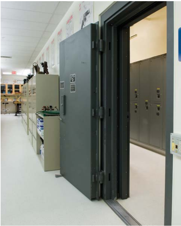
Firearms processed at the ballistics lab (above) are housed in a vault in customized DSM lockers, which provide the flexibility needed to store an array of weapons.

In the ballistics lab, a mechanical-assist HDMS system (left) stores virtually every kind of ammunition known. The unit features eight-inch-deep custom shelves, versus traditional shelf sizes, to conserve space.