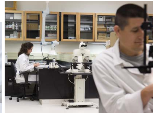
(Left) After evidence is logged, lab scientists conduct a variety of tests and analyses. Here, a forensic scientist places evidence inside a DSM evidence locker. The unit automatically shuts, and when locked, can only be accessed by the person in charge of the tests.