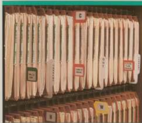
Out Guides, Current Guides, Sidestops and Backstops make your Oblique System even more effective and efficient.