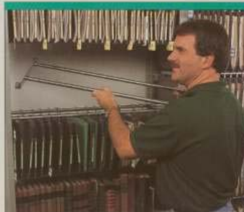
Oblique Rail Assemblies are simple, economic and versatile and adapt to Cantilever, Case-Style, Four Post and any other shelving type.